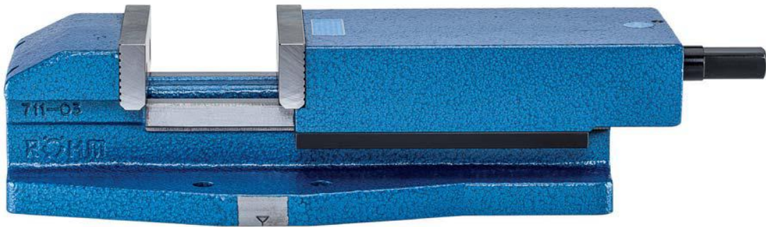
RS machine vice